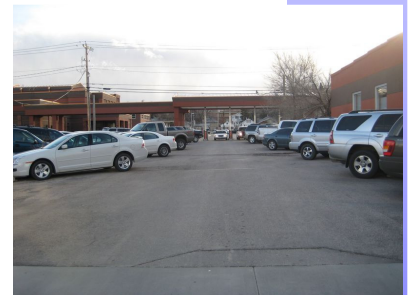
Parking lot also available for sale