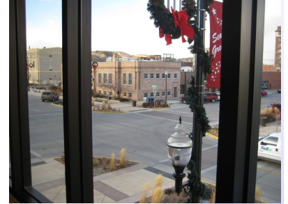
View from the window